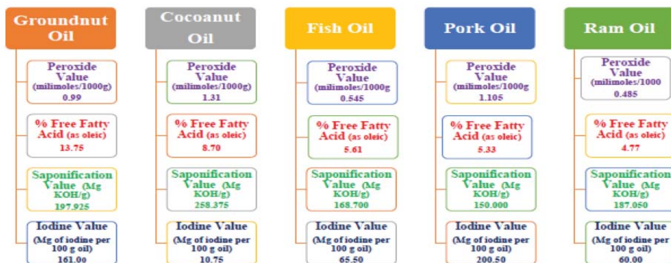
Figure 3 Nutritional Components of the five selected oils from both plant and animal sources.